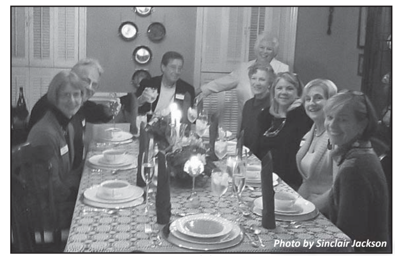
Supper Club group