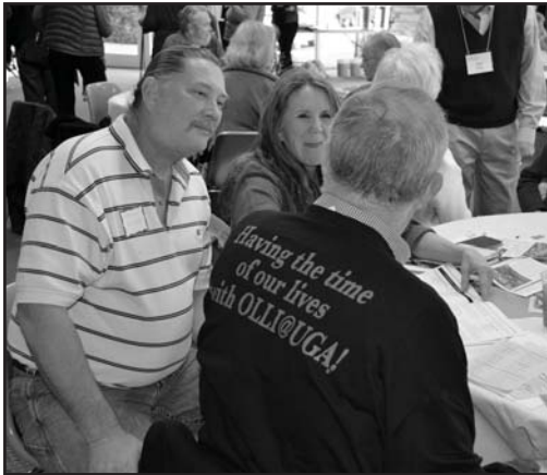
New members getting advice from an experienced OLLI