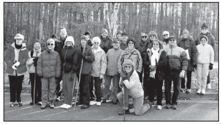
January 14: Happy Hikers brave cold temperatures to hike Lake Chapman. On February 9 they hiked Victoria Bryant State Park. On Saturday, March 24, they will hike Watson Mill Bridge Park; on Saturday, April 14, Kenney Ridge.